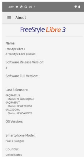
In the App, from the Main Menu select About Screen

If you are wearing a Sensor, you can find the Serial number in the App or Reader. The Serial Number can also be found on the bottom of the Sensor Applicator label and carton.